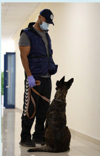
Figure 1: Simple barrier protective equipment is worn during every training session.

Validation protocol: The validation sessions took place in Dubai police k9 training centre. No samples used for training were used for validation. Most of the time, five-cone olfactory line-ups were used. Seven-cone line-ups were used at the end of validation when dog handlers considered their dog ready for deployment in the field. There was always only one covid-19 positive sample in the line-up, with the remaining cones containing covid-19 negative sample(s) (at least one in the line-up) or being empty (i.e. without sampling material). The covid-19 positive and negative sample locations in the line-up were randomly assigned and samples were placed by one dedicated person who remained in the room. The data recorder collected data in the room using dedicated software developed by Dubai police (Figure 2) and was blinded to the covid-19 positive and negative sample locations. Once the samples were placed behind the cones, the handler and the dog entered the room and the dog was asked to sniff each cone, one by one. There was no visual contact between the